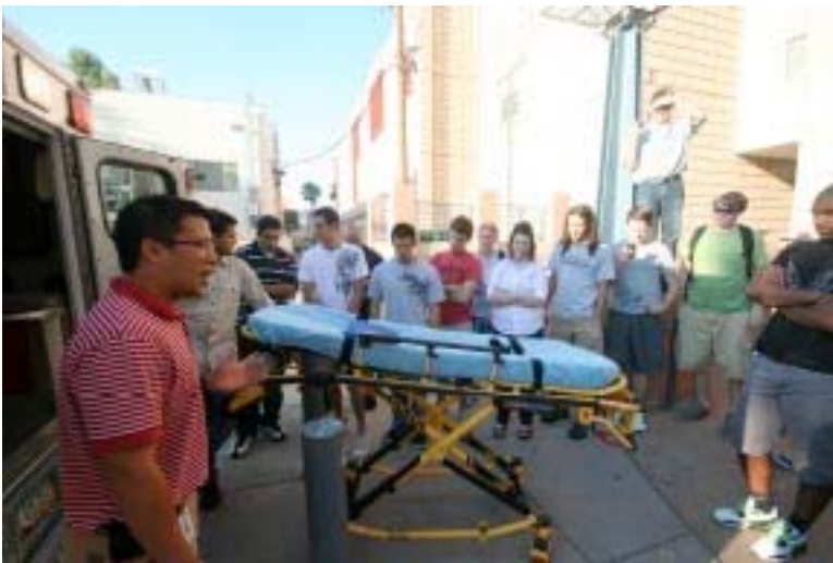
Figure 3. Student teams in InnovationSpace conducting research on a project dealing with design for emergency rescue workers.

In the early stages during the fuzzy front end of new product development, all students are required to drop their disciplinary affiliations as they conduct research in a designated problem area. In some cases, they do observations and interviews as a team. At other times, the students may work in pairs or individually to gather more detailed data in a specific area.