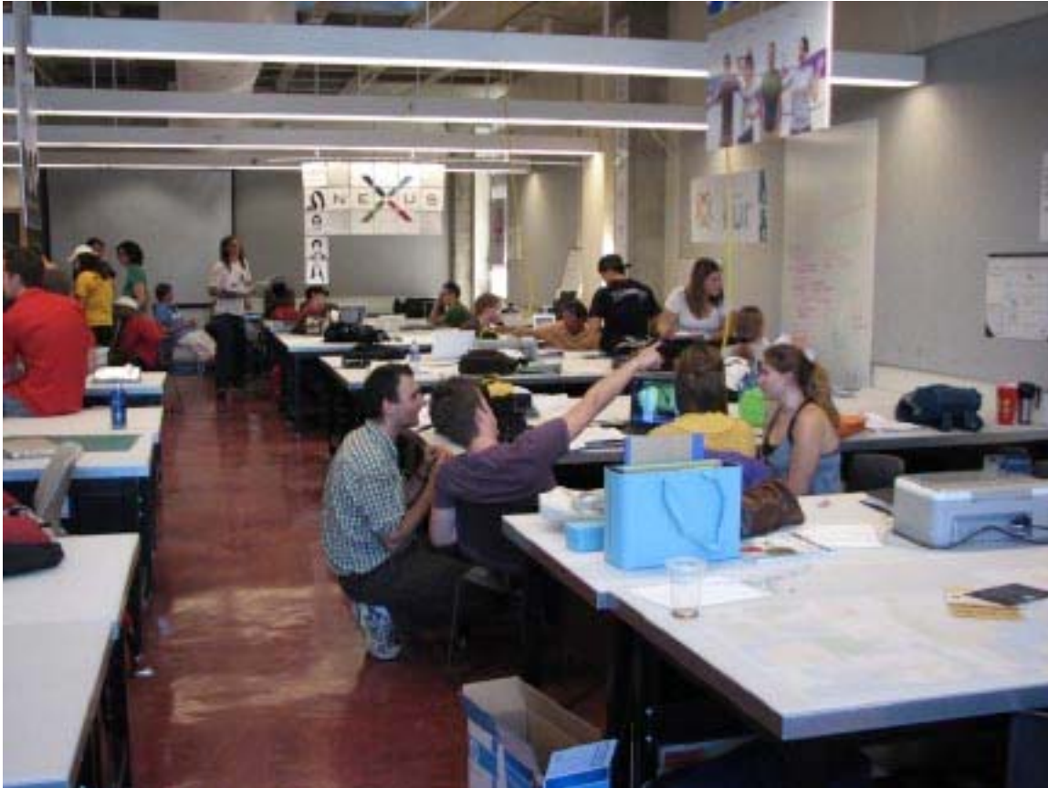
Figure 1. Large shared studio space offers many opportunities for collaboration.

Proposals are presented in both poster and video form and juries evaluate them based on the following: A clear definition and communication of the proposal; reasonable feasibility of the proposal; originality (including new combinations of existing systems and ideas); visual quality and craft of the proposal; and demonstration of integrated disciplinary collaboration.