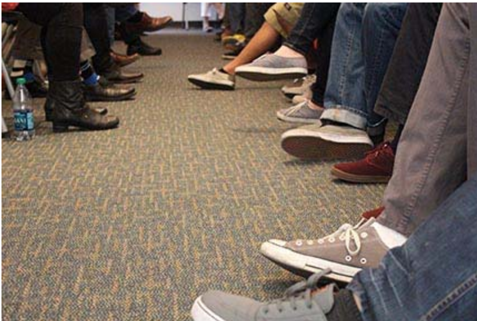
Figure 4. Professional mentors and reviewers meet with students throughout the project.

Each team begins with a directed research and analysis activity, examining and documenting its own direct and indirect contact with the topic. For example, with a topic of “water” student teams might document their own water use in all forms for a 24-hour period of time. As personal and shared experiences are documented, students consider how they might re-imagine their behavior and relationship to topic. Based on their research and analysis each team is asked to design an experience, which encourages others to re-imagine their thinking and behavior about the topic. The projects can range in scale from that of infrastructure, to site and building design, to individual product or visual communication system design. Regardless of the scale, all aspects of the system lead to an examination of design strategies that enhance the experience of potential users. Each team produces a poster and a 5-minute “stand-alone” presentation (video, interactive pdf, Keynote, Powerpoint, Prezi, website, etc.) expanding on the information offered on the poster.