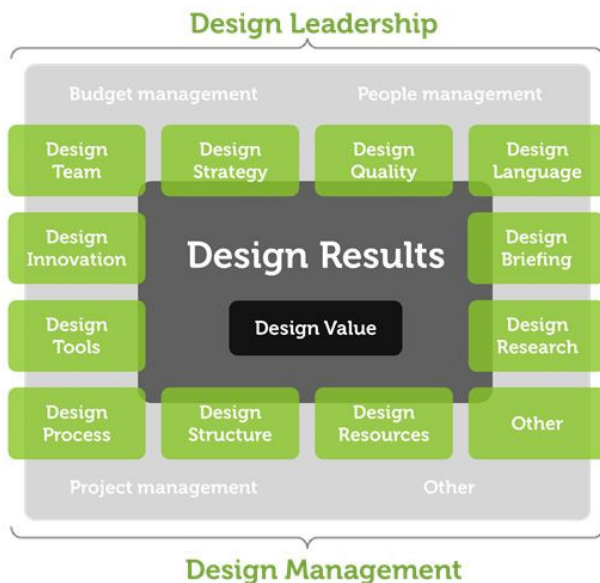
Figure 2. Design Value Framework

In other such organizations, such as Unilever, marketers who are predominantly managing design are afforded internal design management training programs to understand how to best work with their agency partners. In such cases, these workshops have been delivered in one-day onboarding workshops teaching fundamental skills around design process, design briefing, and design quality.