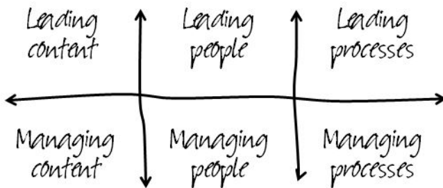
Figure 3. Design Management & Leadership Navigation

It is essential that one must know the differences between leading and managing design, and its implications. These two roles are commonly two sides of the same coin, but often require different skills and attitudes. For example, when working with a fundamental design element, such as design research, it is crucial to understand if one is leading or managing that subject, and how and when to shift between leading and managing. Leading design research may encompass setting the direction and objectives, while managing design research may encompass ensuring the proper resources, timelines and budgets are set and adhered to for the research to be delivered and applied to the projects. When switching between leading and managing, it is important to understand the strategy, desired output, the people involved, and enabling process(es). Figure 3 showcases a general navigational framework to identify different quadrants one may be active in when working across the fundamentals shown in Figure 2. Managers and leaders should frequently pose the questions to themselves of if they should be leading or managing content, people or processes.