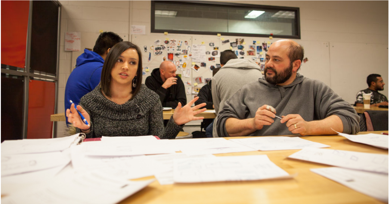
Students providing feedback on their peers' initial concepts

By the next class session, students were expected to have developed five iterations for each of the three chosen concepts to present to the class in a second review period. During this second review period, each student presented their concept variations as well as their initial research. The class as a whole then discussed and decided which one of the three concepts had the greatest market potential and was most deserving of further in-depth market research and simultaneous product development. Once these two initial sketch reviews were complete, each student in the class had a single product concept that had been vetted by the entire class.