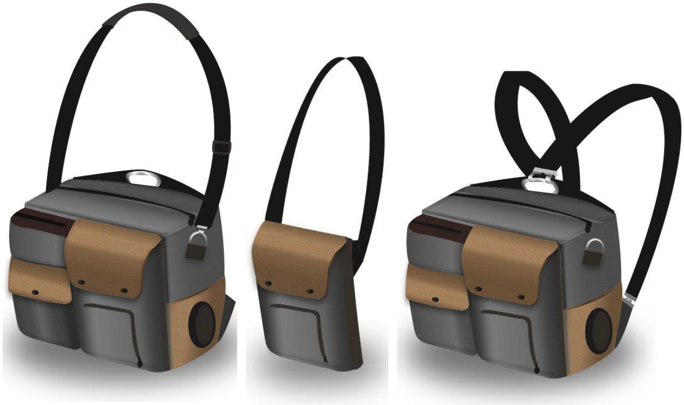
Diaper bag system designed for men with the option to convert to backpack