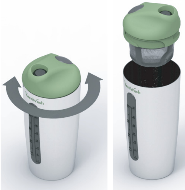
Household product for rinsing and cleaning quinoa