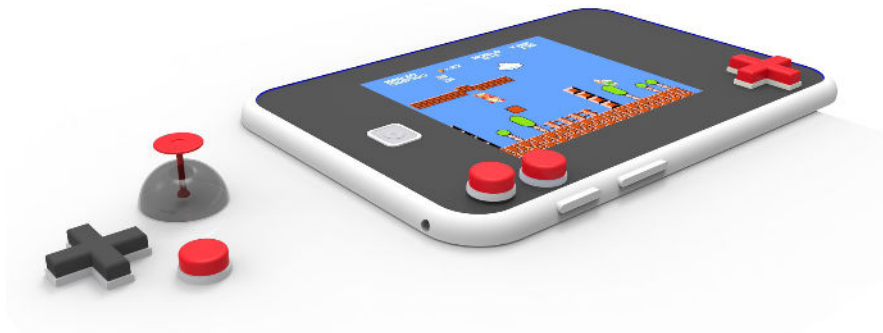
Tactile button system for touch screen gaming

The following are a few examples of products that students developed through their feasibility studies: